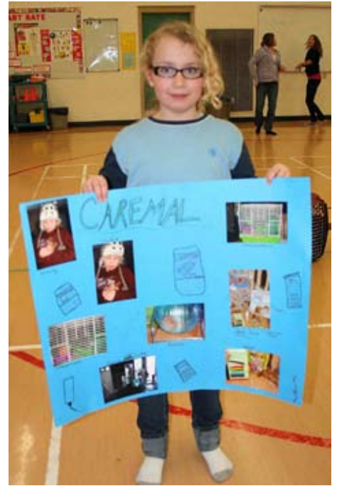
Look what I've learned about hamsters