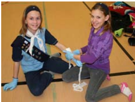
I'll bandage you if you'll bandage me!