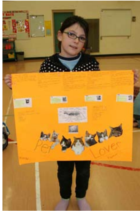
Here's what I've learned about cats