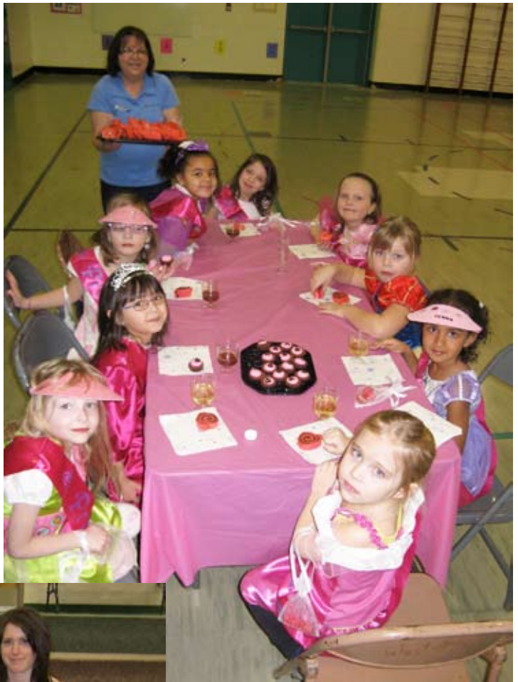
307th Sparks Unit