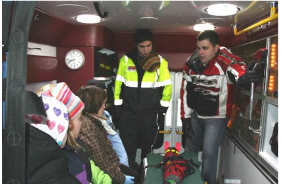
Listening hard to what the trainers have to tell the Guides