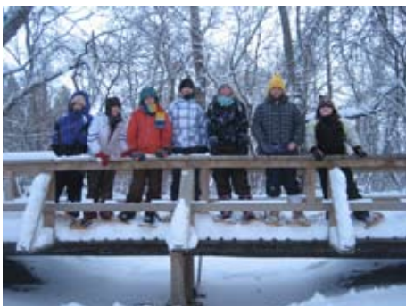
Snowshoeing to our geocache site