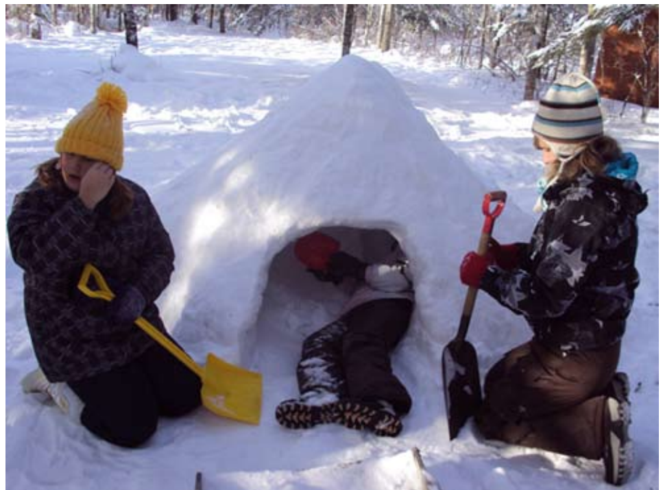
Quinzee building is hard work!