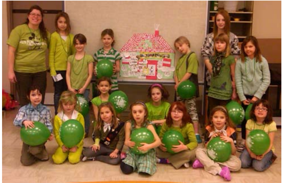
Here we are showing off everything green!

The chimney spews out love, laughter, friendship, knowledge and fun. And, finally there is a birthday cake inside because February 22nd is Lord and Lady Baden Powell's' birthdays. The Brownies did an amazing job of constructing the house! Don't you think?