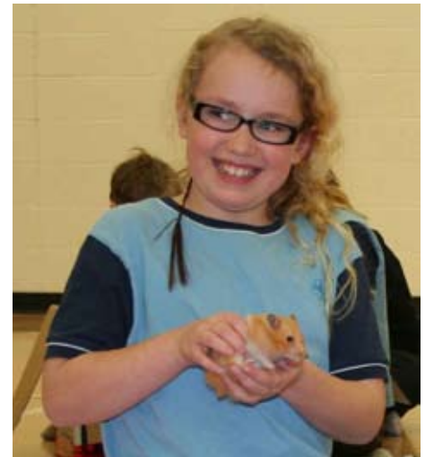
Here's my hamster