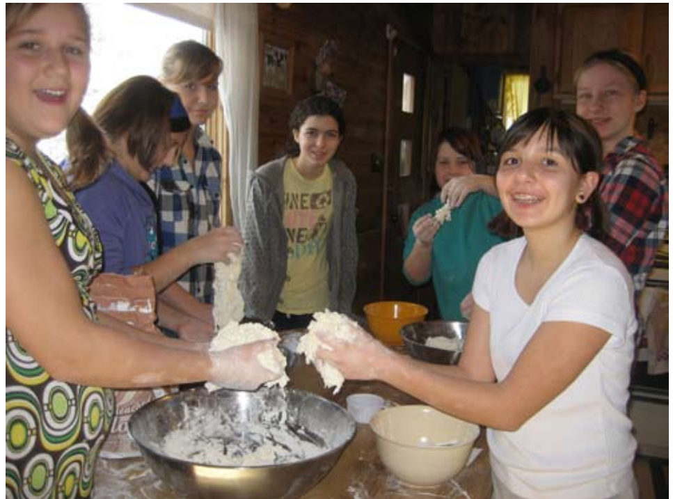
Baking bread and cinnamon buns

Saturday was busy, busy! We were up early so that our homemade bread and gooey cinnamon buns would be ready for dinner that night. (Yummy!) We also had to finish the quinzee we started the night before. The girls decide to hide a geocache and snow shoed to their chosen hiding spot. (We will be back again next year to check on it.) We rounded the day off with more geocaching, crafts and watching the local deer. Before everyone packed up and left on Sunday we still had time to get in one more hike on the local nature trail.