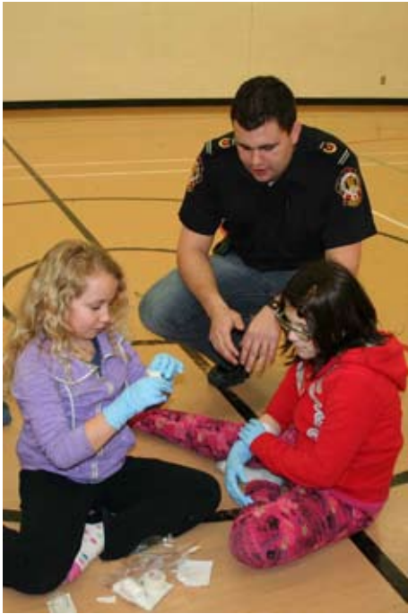
That's it - you've got it now