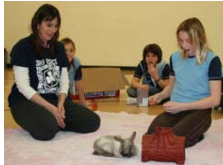
Wow, look what my bunny can do