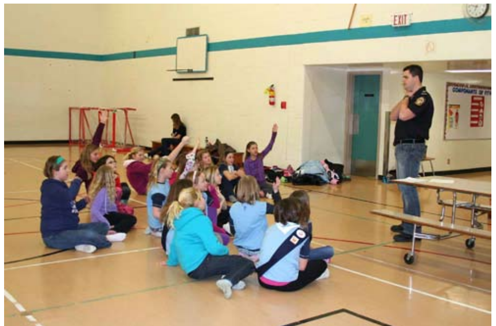
Pick me - I know the answer!