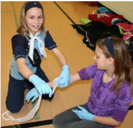
First Aid is more fun when you do it with friends

Guides in Clandeboye have been working on their first aid badge and pet keepers. Here are some photos showing them participating in these activities.