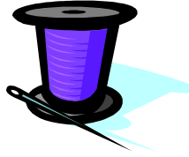
Thread that will blend in nicely such as beige